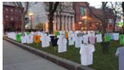
Trinity & St. Philip's 2015 "Memorials to the Lost"