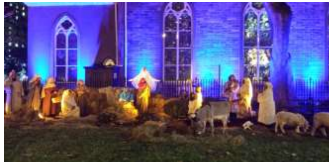
Our 2015 Living Nativity