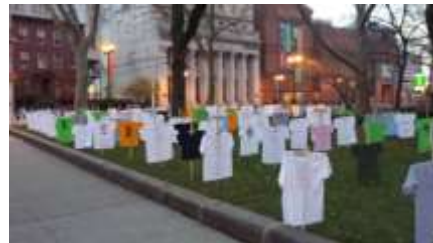
Trinity & St. Philip's 2015 "Memorials to the Lost"