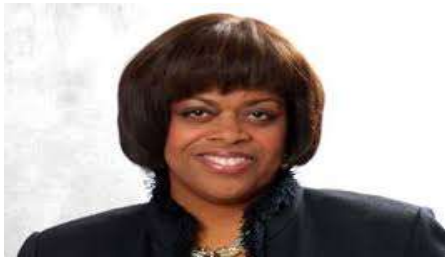
Suzan Johnson Cook 3rd Ambassador at Large for International Religious Freedom for the United States of America Term Appointed: May 2011 – October 2013

For the past four and a half years, a two year Senate Confirmation hearing process and two and a half years in the post, (from May 2011-October 2013) Ambassador Suzan Johnson Cook (Ambassador Sujay) served as the 3rd Ambassador at Large for International Freedom for the United States of America.